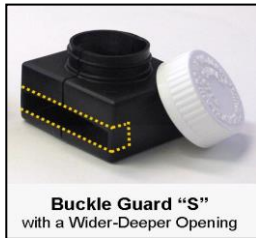
Buckle Guard "S" with a Wider-Deeper Opening