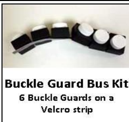
Buckle Guard Bus Kit 6 Buckle Guards on a Velcro strip